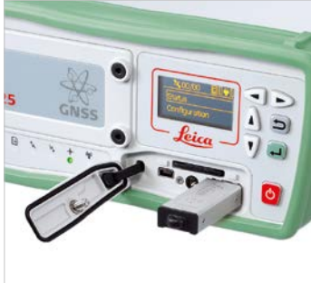
SMART DATA STORAGE