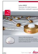
Leica AR20 Leica AR25 Leica AR10