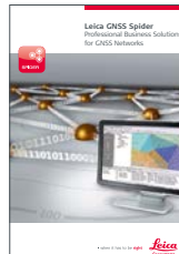
Leica GNSS Spider Leica SpiderWeb Leica SpiderQC

Illustrations, descriptions and technical data are not binding. All rights reserved. Printed in Switzerland – Copyright Leica Geosystems AG, Heerbrugg, Switzerland, 2016. 846243en – 12.23