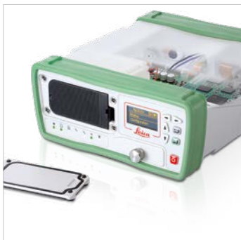
SMART POWER SOLUTIONS