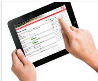
MODULAR REFWORX SOFTWARE